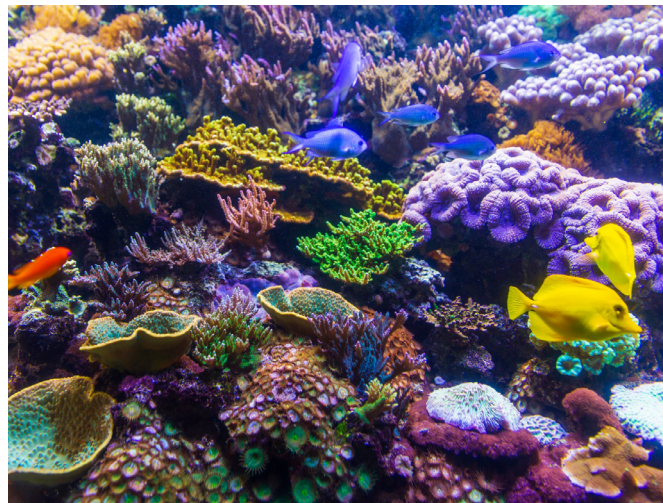
A colourful coral reef ecosystem

The relationship between algae and corals is an example of symbiosis - each organism depends on the other for survival. Corals are animals so they rely on the photosynthesising algae for food. Corals provide the algae with a safe environment and their waste supplies the compounds needed for photosynthesis. In return, the algae supply the corals with glucose and oxygen produced through photosynthesis. The corals use the glucose and oxygen for respiration and for making other molecules such as proteins and calcium carbonate. The calcium carbonate is used to build skeletons which form the foundation of the reef.