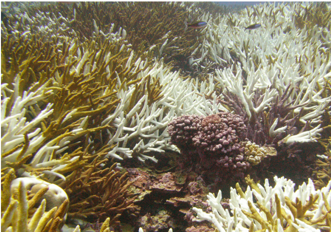
Coral reef after a bleaching event

It is not only humans that cause problems for coral reefs. Warmer sea temperatures and water pollution have led to population outbreaks of crown-of-thorns starfish, which feed on corals and cause extensive damage to the reefs. Unfortunately, the starfish feed on the corals at a faster rate than the corals can reproduce.