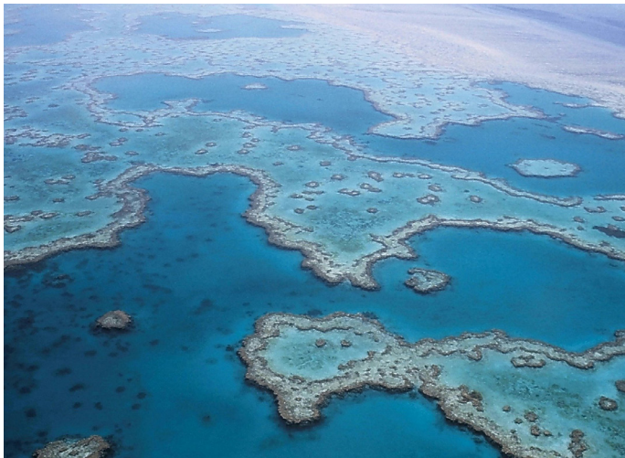
The Great Barrier Reef

Corals are living organisms that form coral reefs, delicate ecosystems that look like colourful gardens under the sea. Coral reefs are some of the most biodiverse ecosystems in the world, supporting 25% of all marine species, including fish, sea sponges, starfish and crabs. The largest coral reef, the Great Barrier Reef, is off the coast of Queensland, Australia. It covers over 133 000 square miles, an area equivalent to over 64 million football pitches. Corals have microscopic algae living inside their tissues, which gives the coral reef its beautiful colours. The biggest coral reefs are found in tropical waters because the warm, clear, shallow water provides an ideal environment for the algae to photosynthesise.